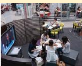
Doshisha Learning Commons